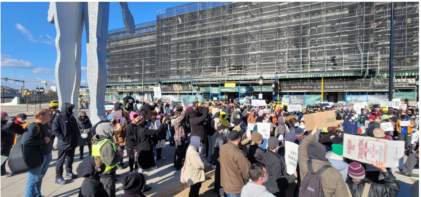
Penn Station Baltimore preparing to march to 7th Congressional District Office of Rep. Kweisi Mfume

Today November 20 - 20 days after our march and rally Rep. Mfume announces he supports an immediate ceasefire! He joins 40 other members of the House. Also today Oregon Senator Jeff Merkley joined Dick Durbin to make a total of 2 in the US Senate – keep your eyes on the Prize! Hold on!!