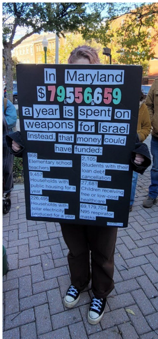
There is always more and more money for War